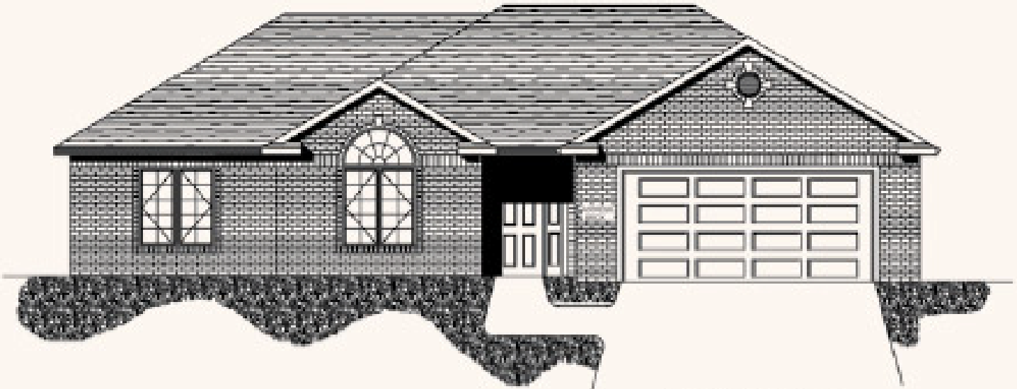
FRONT ELEVATION D

RENDERINGS AND FLOOR PLANS ARE ARTIST'S CONCEPTION OF TYPICAL HOMES AND DO NOT NECESSARILY REPRESENT FINAL PLANS, DIMENSIONS, DESIGNS OR ELEVATIONS. PRICES, PLANS AND SPECIFICATIONS ARE SUBJECT TO CHANGE WITHOUT NOTICE.