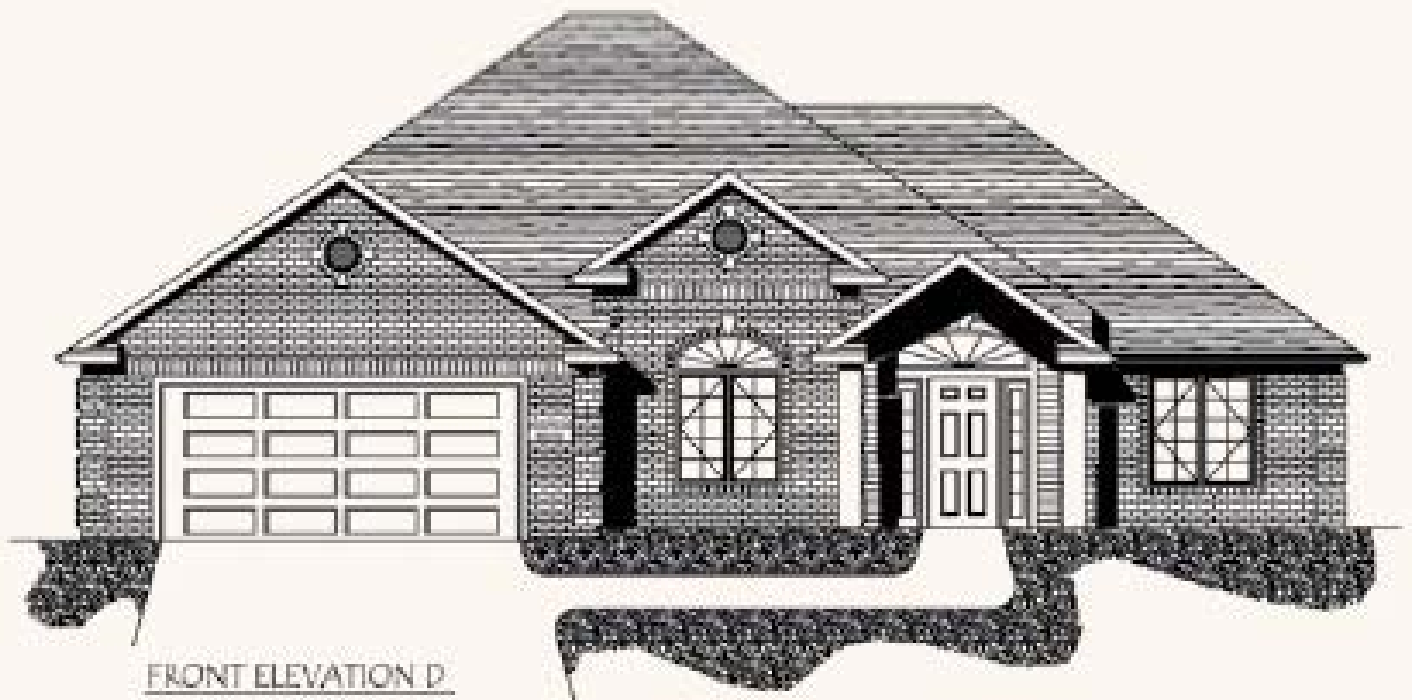
FRONT ELEVATION D

RENDERINGS AND FLOOR PLANS ARE ARTIST'S CONCEPTION OF TYPICAL HOMES AND DO NOT NECESSARILY REPRESENT FINAL PLANS, DIMENSIONS, DESIGNS OR ELEVATIONS. PRICES, PLANS AND SPECIFICATIONS ARE SUBJECT TO CHANGE WITHOUT NOTICE.