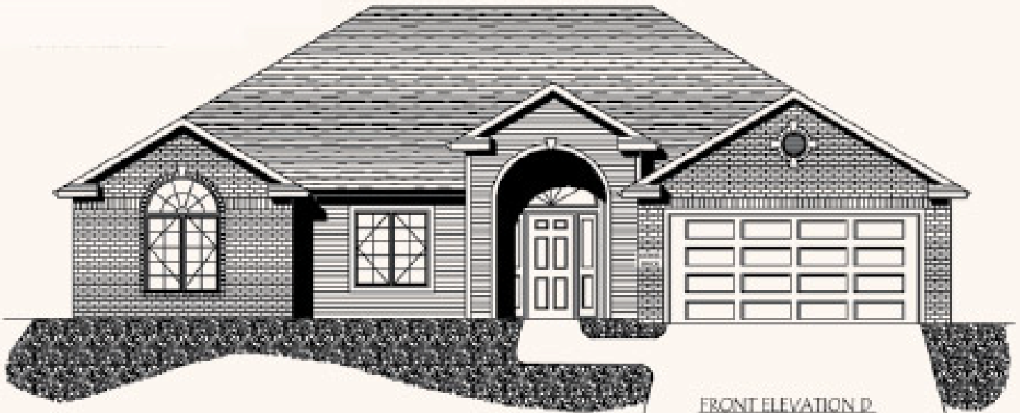
FRONT ELEVATION D

RENDERINGS AND FLOOR PLANS ARE ARTIST'S CONCEPTION OF TYPICAL HOMES AND DO NOT NECESSARILY REPRESENT FINAL PLANS, DIMENSIONS, DESIGNS OR ELEVATIONS. PRICES, PLANS AND SPECIFICATIONS ARE SUBJECT TO CHANGE WITHOUT NOTICE.